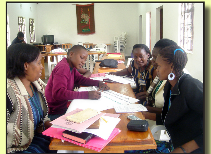
Intergenerational teams of women, ranging in age from 15 to 50, came to Mwangaza Centre last month. New insights emerged after studying HIV/AIDS, gender violence, peer pressure, women's health, and conflict resolution. Who made it happen? YOU!